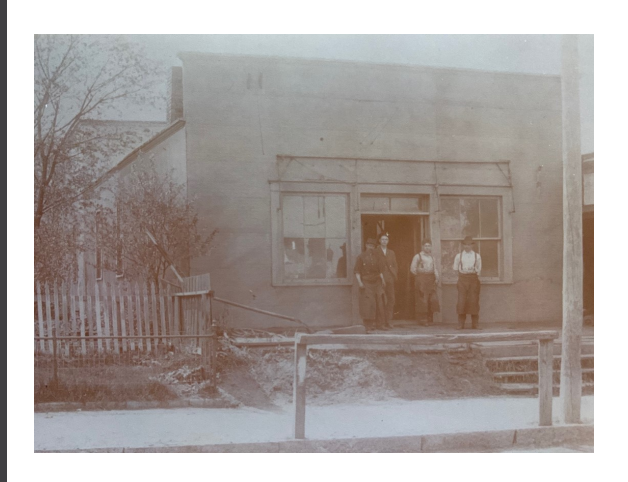
John March Blacksmith Shop on South Sampson Street